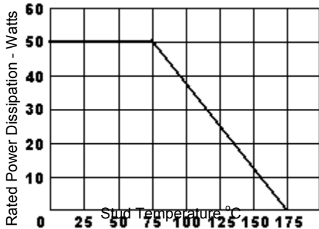
FIGURE 1 Power Derating Curve