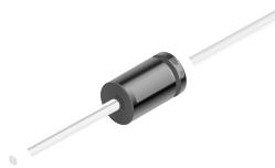
DO-35 Glass case COLOR BAND DENOTES CATHODE