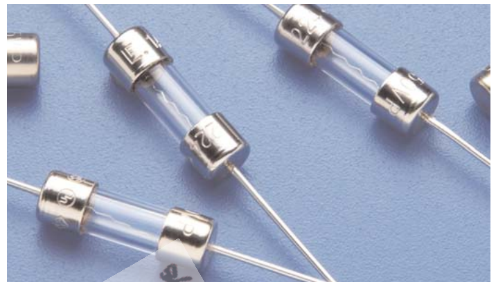
2205 000P Series

Wave solder- 500°F(260°C), 3 seconds Max. Reflow solder- Not recommended