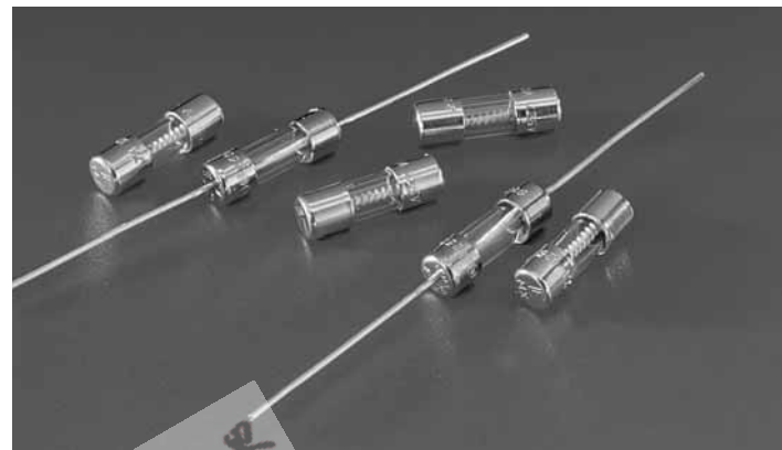
229 000P Series

PACKAGING OPTIONS: 230P Series available on Tape and Reel per EIA-296. For 1500 pieces per reel, add packaging suffix DRTIP. See page 8 for pitch dimensions. 229P and 230P series available in bulk packaging. For 1000 pieces bulk, add packaging suffix MXP.