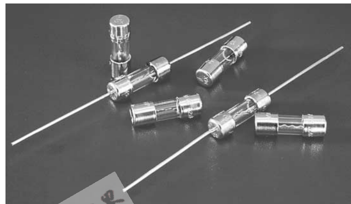
225 000 Series