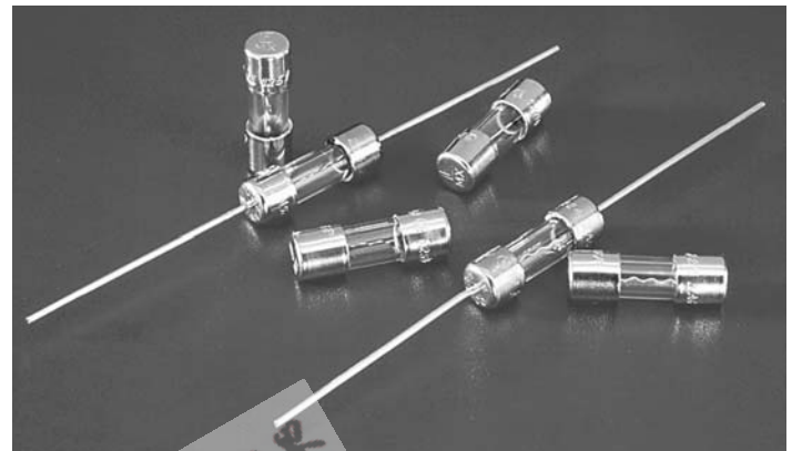
225 000P Series

*Rating is available in a 250VAC version. To order please use 0224005.MX250UP.