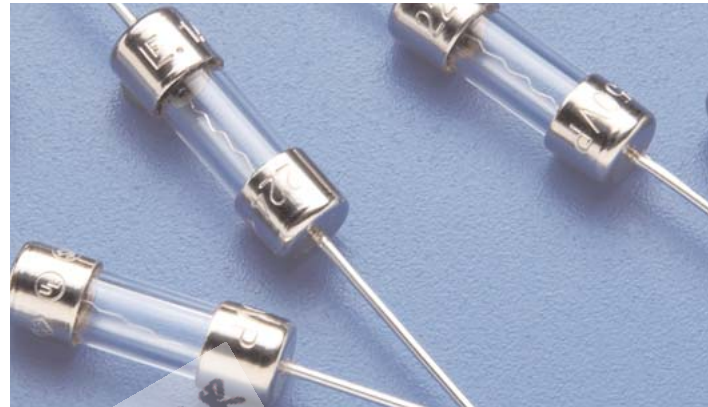
2206 000P Series

Wave solder- 500°F(260°C), 3 seconds Max. Reflow solder- Not recommended