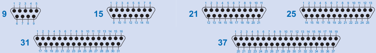
Mating Face View of Pin Connector. Socket connectors have reversed cavity numbers.