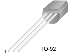
1. Emitter 2. Collector 3. Base