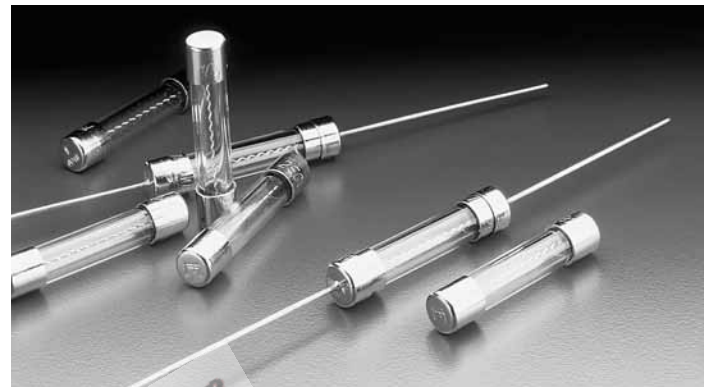
312 000 Series