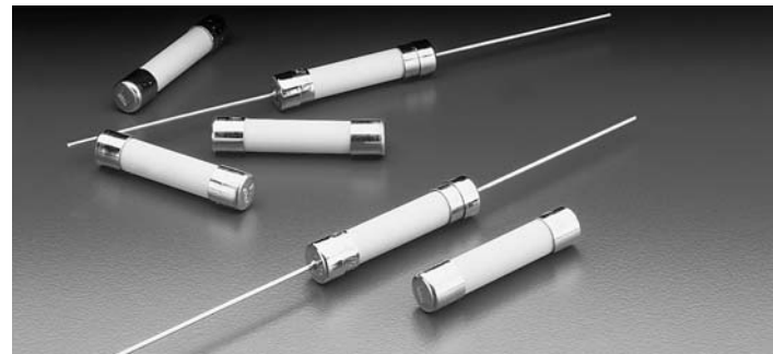
314 000 Series