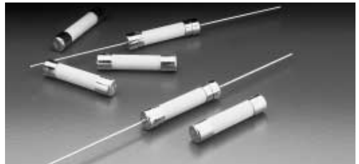
314 000 Series