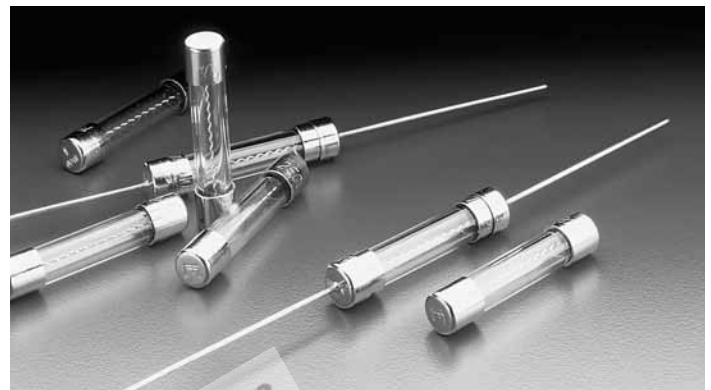
312 000P Series 318 000P Series