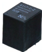
Dust Covered 17.5×15×20