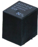
Dust Covered 17.5×15×20