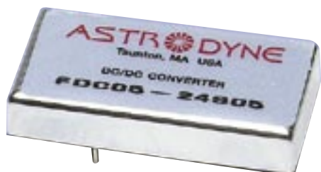
Unit measures 1"W x 2"L x 0.375"H