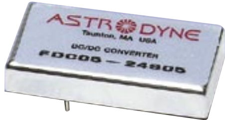
Unit measures 1"W x 2"L x 0.375"H