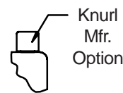
Sym. A Socket Head