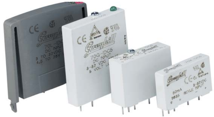
70L-IDC 70G-IDC 70-IDC 70M-IDC