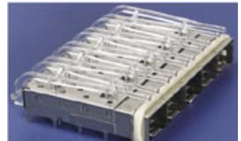
Side View: 1-by-5 lightpipe cover (Series 74729) on 1-by-5 SFP cage (Series 74723)