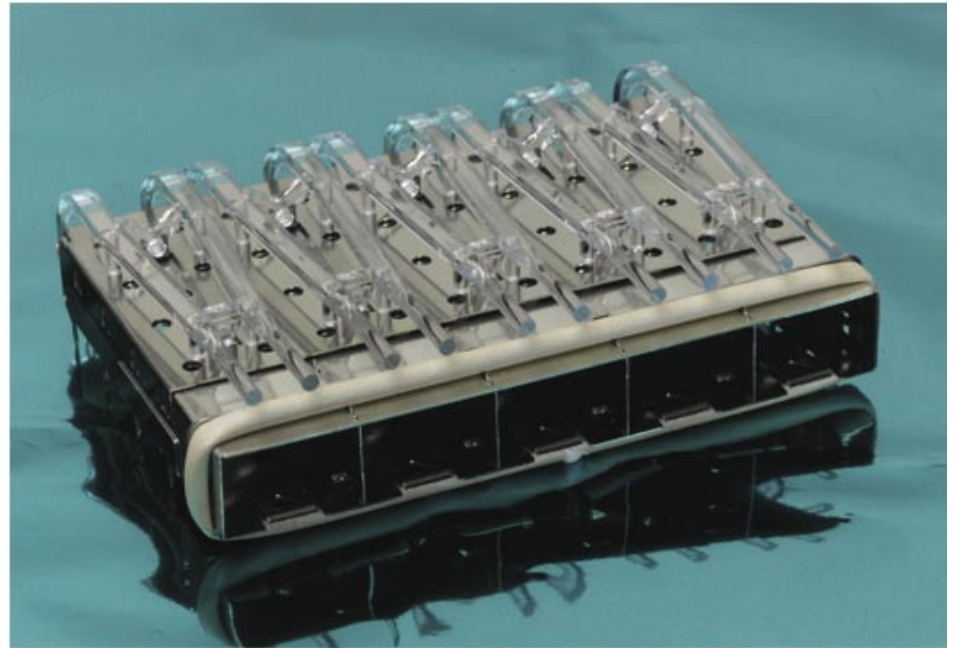
Lightpipe cover mounted on 1-by-5 SFP cage