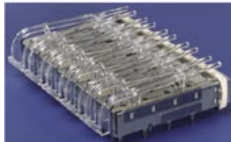
Rear View: 1-by-5 lightpipe cover (Series 74729) on 1-by-5 SFP cage (Series 74723)

Light Pipes: Polycarbonate, V0 Rated Light Pipe Cover: C770 Alloy Operating Temperature: -55 to +105° C