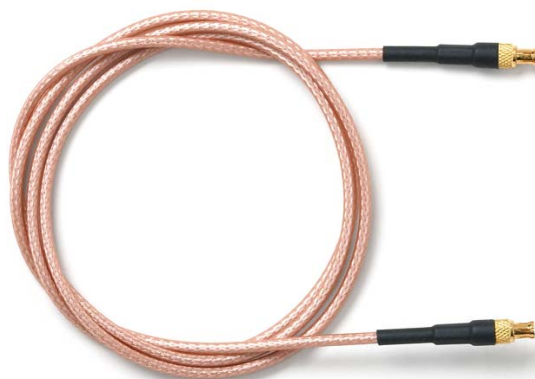
Model 73075-VV MCX Plug to MCX Plug, RG179B/U, 75 Ohm

Snap-on coupling and miniature size for fast connect and disconnect where space is limited