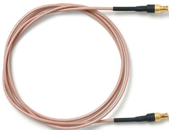
Model 73075-UU MCX Plug to MCX Plug, RG178B/U, 50 Ohm

MCX Plug to MCX Plug, RG178B/U (50 Ohm), RG179B/U (75 Ohm)