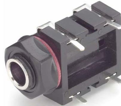
Model 7159 Horizontal 2-Conductor Jack, PC Board Mount