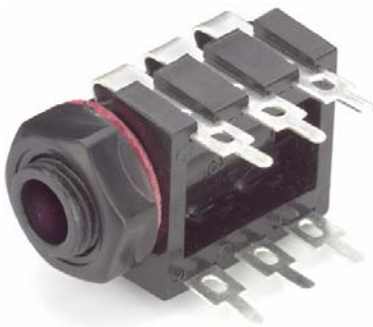
Model 7160 Horizontal 3-Conductor Jack, Solder Tabs