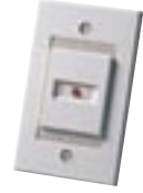
RA400Z Remote Annunciator (UL S2522)