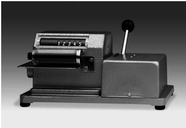
FD270 - Impulse counter