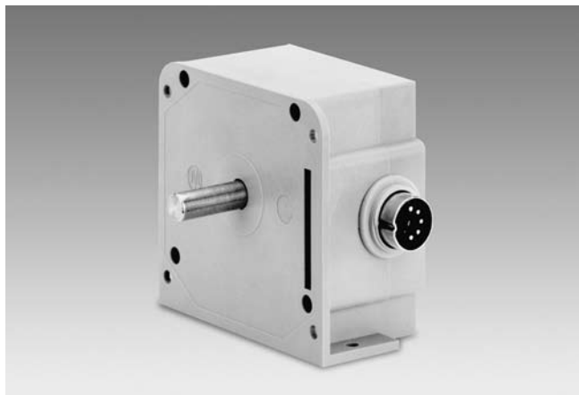
G 305 with single shaft