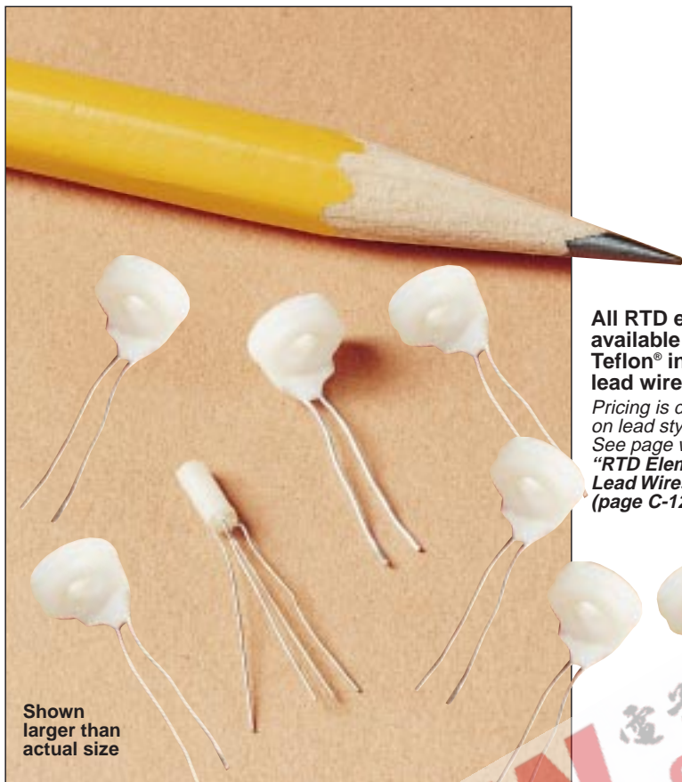
Shown larger than actual size

All RTD elements available with Teflon® insulated lead wire.