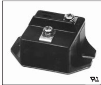
CS240610, CS241210 Fast Recovery Single Diode Modules 100 Amperes/600-1200 Volts