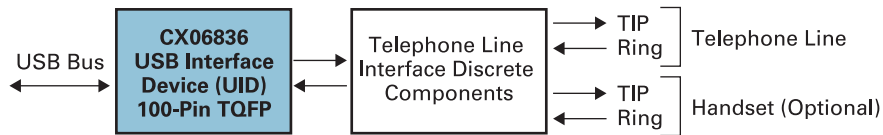
CX06836 Modem Simplified Interface Diagram