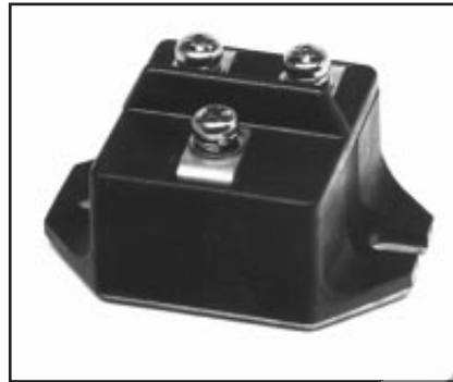
CS241020 Fast Recovery Single Diode Module 200 Amperes/1000 Volts