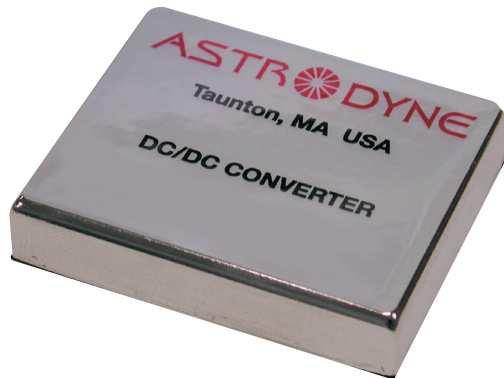
Unit measures 1"W x 2"L x 0.375"H