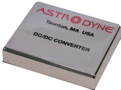
Unit measures 1"W x 2"L x 0.375"H