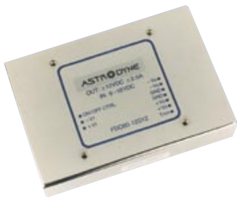
Unit measures 2.76"W x 3.94"L x 0.75"H