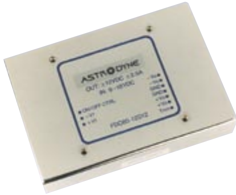
Unit measures 2.76"W x 3.94"L x 0.75"H