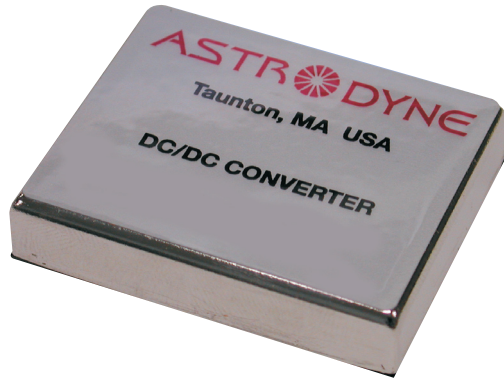
Unit measures 1"W x 2"L x 0.375"H