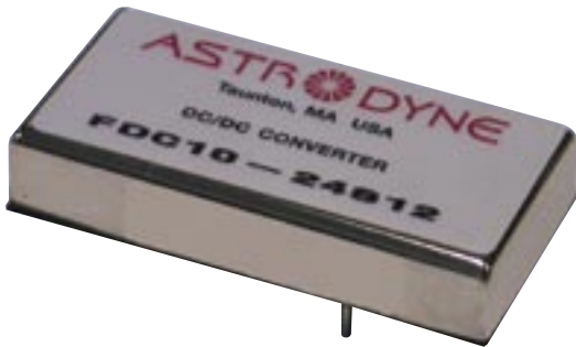
Unit measures 1"W x 2"L x 0.375"H