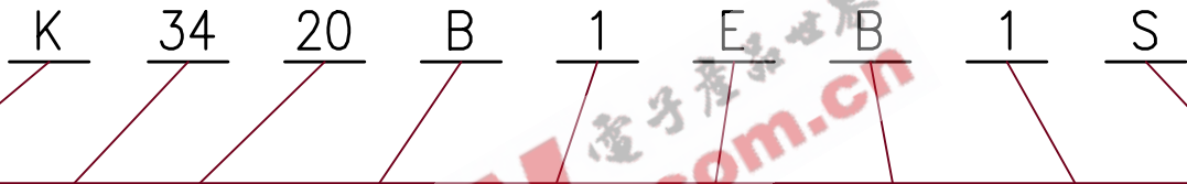
Silicon Power Rectifier Plate Heatsink Assembly Coding System