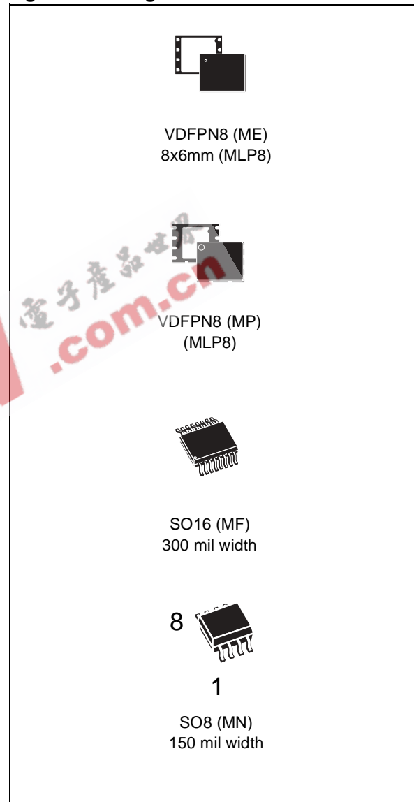
Figure 1. Packages