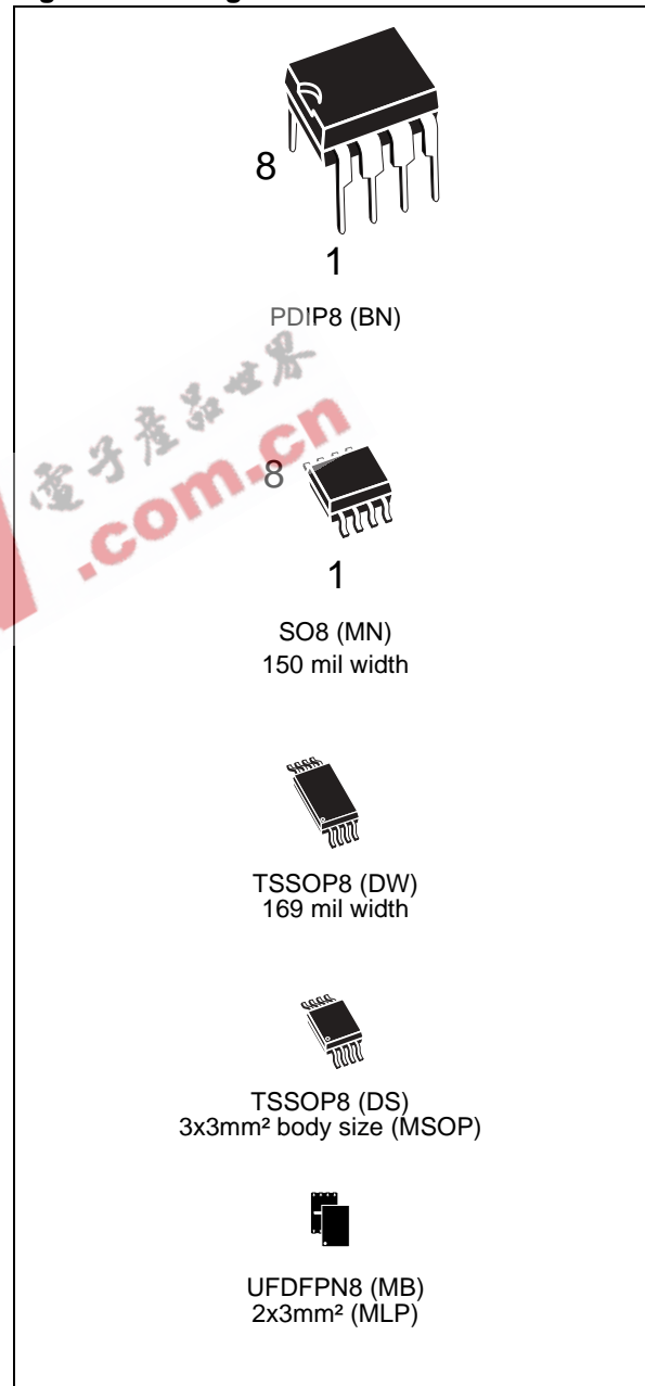
Figure 1. Packages