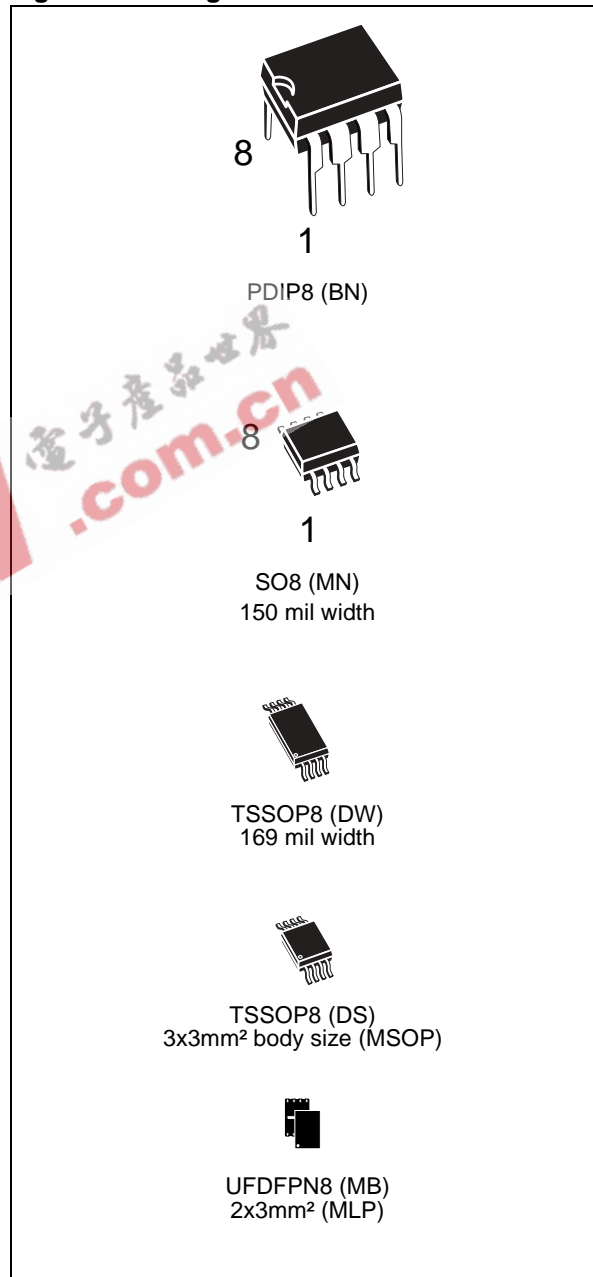
Figure 1. Packages