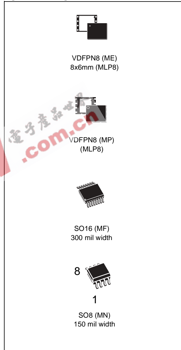
Figure 1. Packages