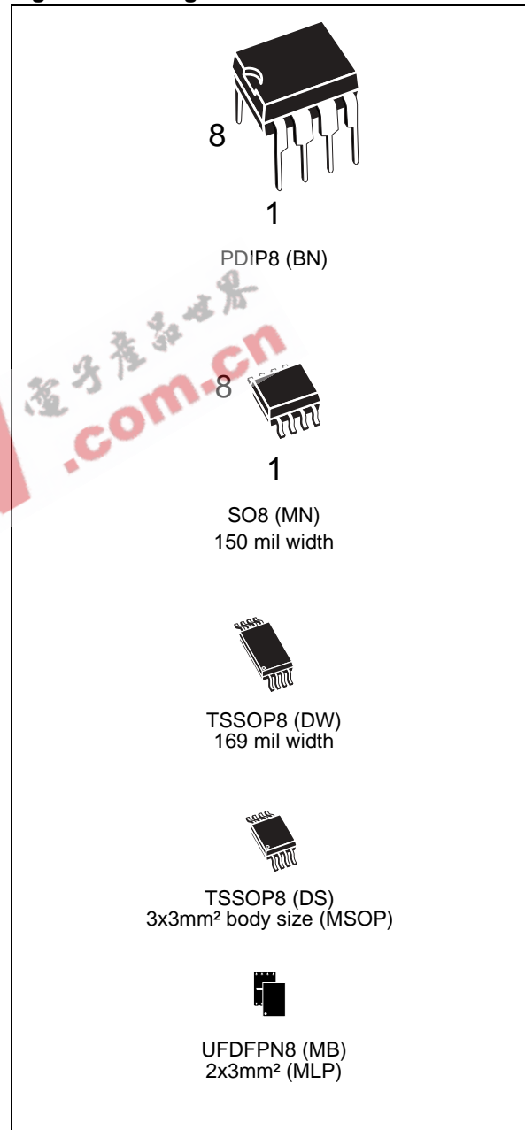
Figure 1. Packages