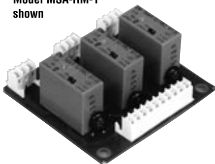
Model MSA-RM-1 shown

Replacement Relay Modules for MINI-SCREEN ® and MICRO-SCREEN ® Metal Boxes