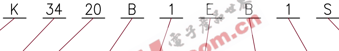
Silicon Power Rectifier Plate Heatsink Assembly Coding System