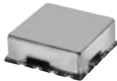
CASE STYLE: DV874