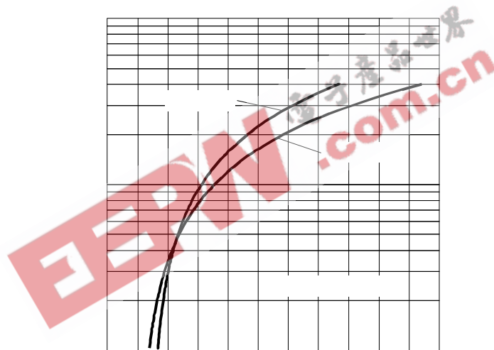
Fig. 7 - On-state Voltage Drop Characteristics