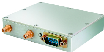
BLUE CELL™ CASE STYLE: GZ1067